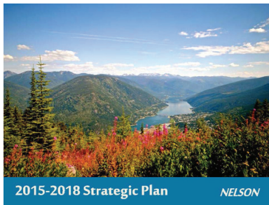
2015-2018 Strategic Plan NELSON

Along with these goals, the Plan lays out how we will achieve our goals and how we will measure our success. To view the plan, please visit www.nelson.ca under the Publications and Reports section.